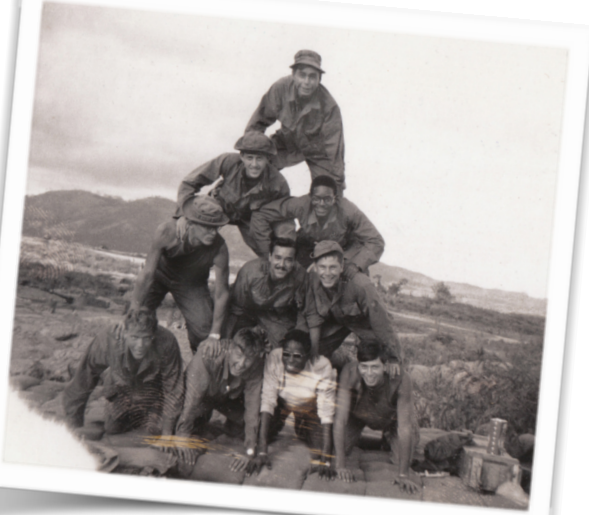
Clowning around in the field, here members of Delta’s 1st platoon (1969) take time to

Photo courtesy of “Chopper” Black 1968/69