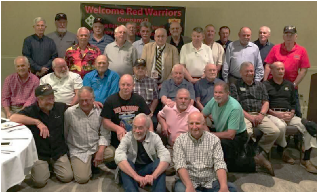
The whole Delta gang